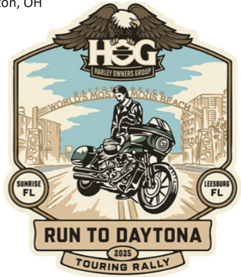
2025's first touring rally is the Run to Daytona on February 23-25!